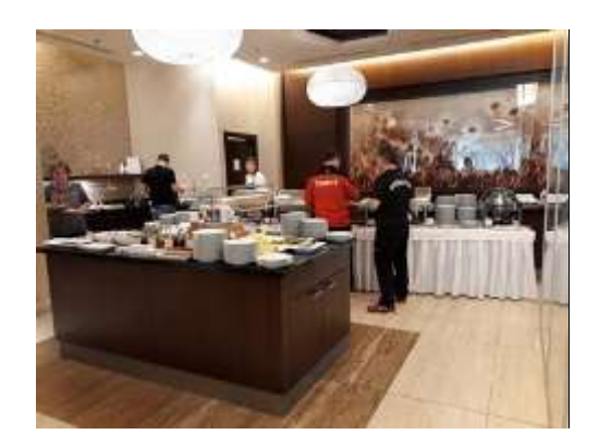
on the ground floor