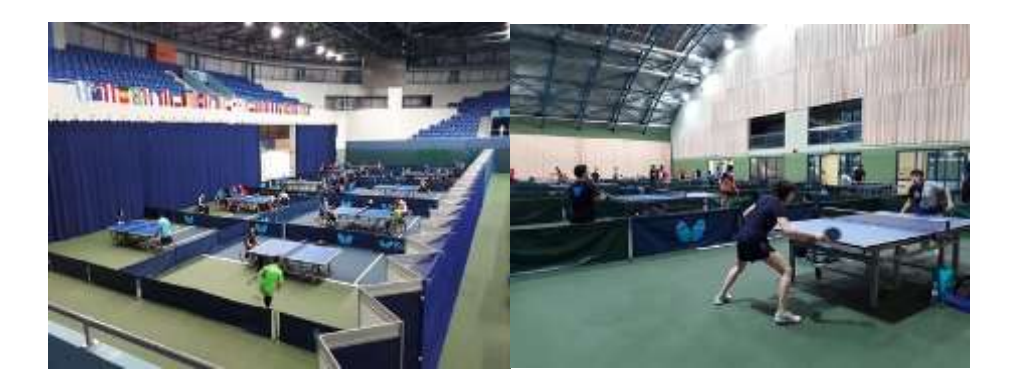
Left – wheelcher training hall, right – standing training hall

The main hall and the trening hall were together, for standing players on first floor and for wheelcher on ground floor